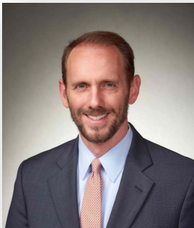
SCOTT SIFTON CANDIDATE FOR US SENATE scottsifton.com